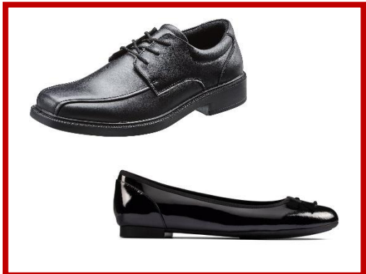
BLACK SOCKS AND BLACK SHOES

Note: Any plain black shoe is permissible. The shoe must be flat, formal, logo free and entirely black with no additional colours.